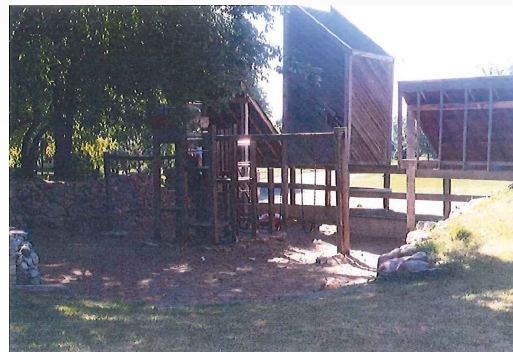
1996 Original Tot Lot Neighborhood 8

We live in the Clover Field neighborhood and really like the quietness as opposed to the city.