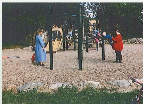
Finished tot lot during block party 1997.